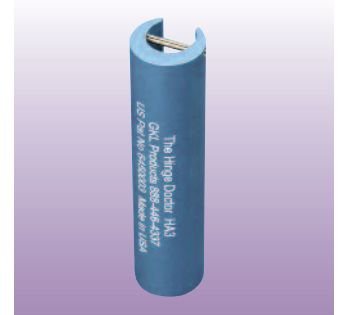
HA3 — Fits 5" x 5" ball bearing hinges