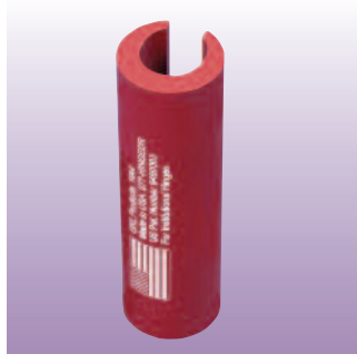
HA4 — Fits institutional hinges, spring hinges, prison hinges, and many other speciality hinges.