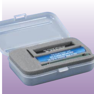
HA1-3 kit — Residential/Commercial 3 piece kit: HA1, HA2, HA3