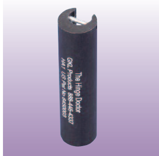
HA1 — Fits commercial 4.5" x 4.5" hinges