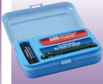
HA1-4 kit — All-in-one 4 piece Kit: HA1, HA2, HA3, HA4