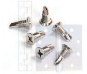
Special Hinge Screws — Self drilling, self tapping, #14 screw with #12 head to replace #12 stripped out hinge screws