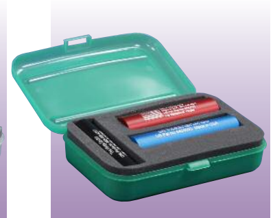
HA134 kit — Commercial 3 piece kit: HA1, HA3, HA4