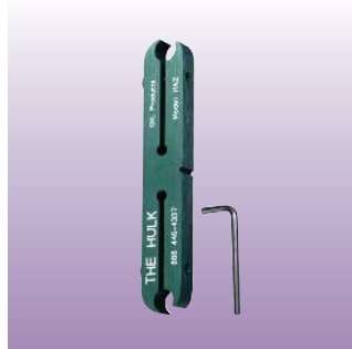
HA2 — Fits 90% of all residential hinges and timely door frames